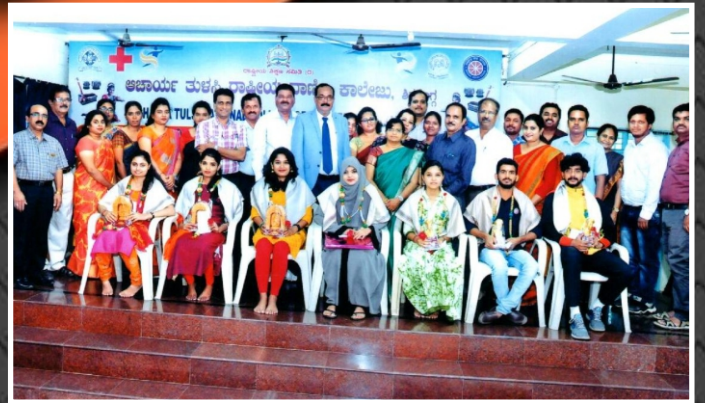
Felicitation to Rank Holders & Achievers