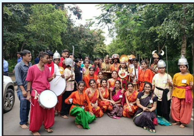
Participation in Sahyadri Utsav