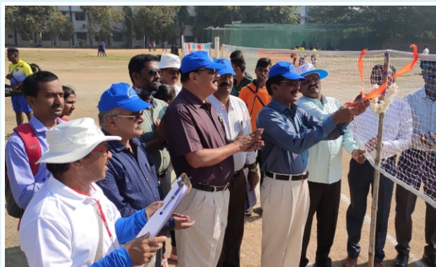
KU Level Ball Badminton Tournament