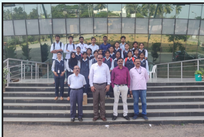
Trainee Students Visit to Gallagher Co.