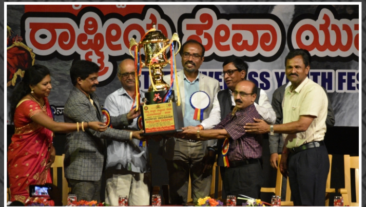
State Level NSS Youth Festival