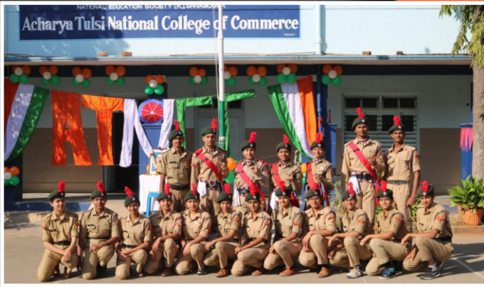
College NCC Unit