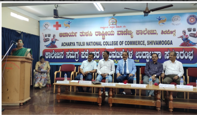
Inaugural Function of College Co-Curricular activities