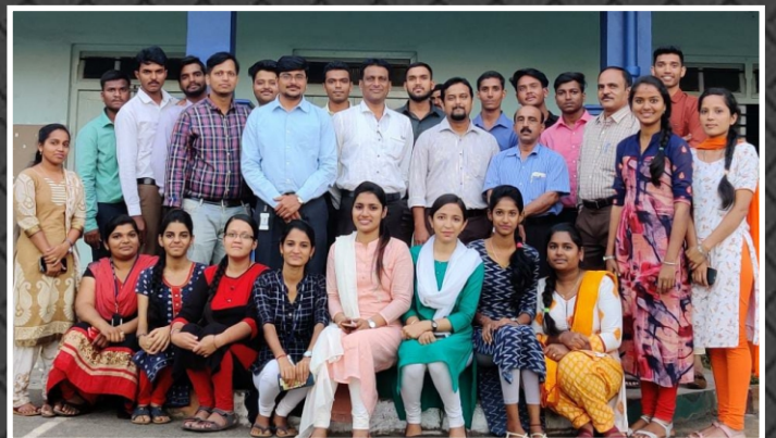
Campus Selection by TCS