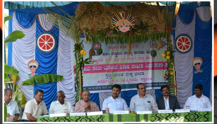
Village NSS Camp