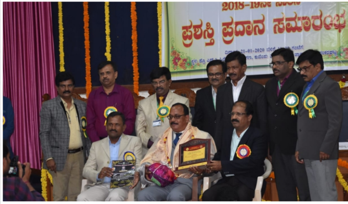
Best NSS Unit & Programme Officer Award