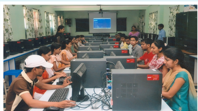
Well Established Computer Lab