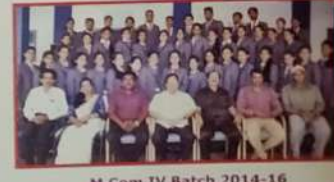
M.COM. IV Batch 2014-16