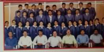
M.COM. II Batch 2012-14