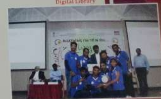
Student Secured Team Champion Ship