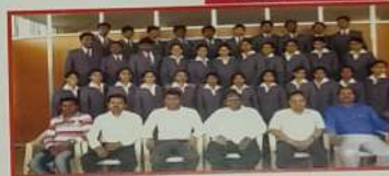
M.COM. I Batch 2011-13