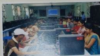
Well Equipped Computer Lab