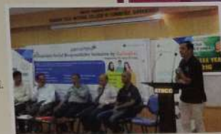
Soft Skill Training by Gallagher Company