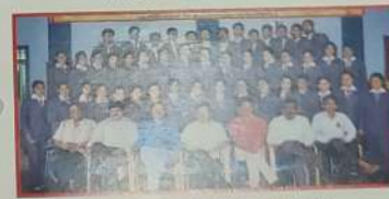
M.COM. III Batch 2013-15