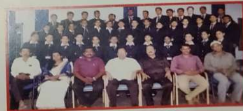
M.COM. V Batch 2015-17