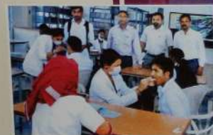
Health Check-up Camp under Red-Cross